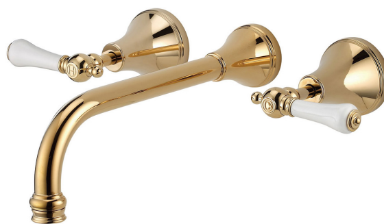
Porcelain Brass Gold